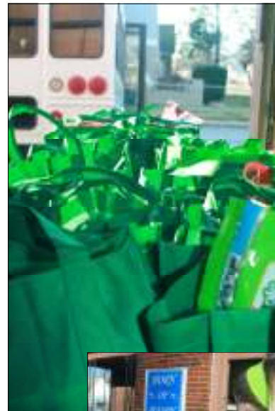
The Youth delivered our green bags to the Horn of Plenty Dec. 20 and got a tour of the facility.