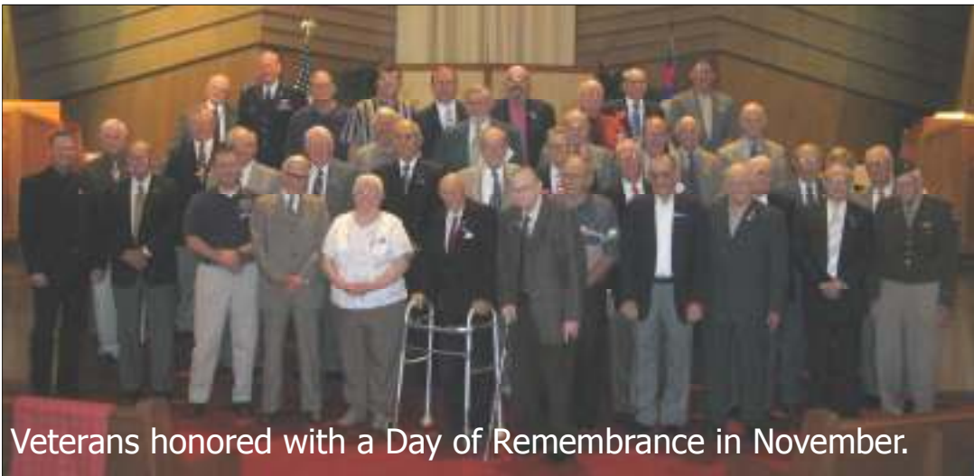
Veterans honored with a Day of Remembrance in November.