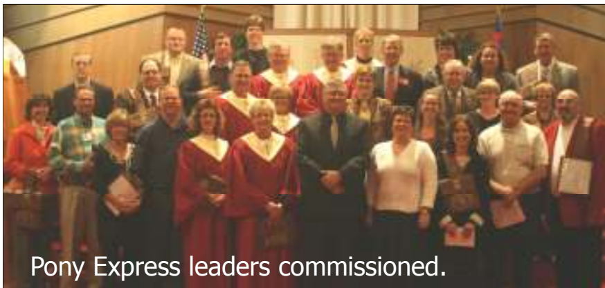
Pony Express leaders commissioned.